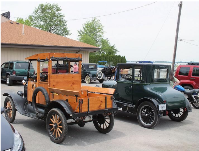
Parking lot at Behm's.